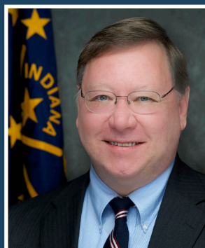
Senate District 11