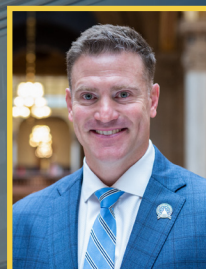
State Senator Chris Garten Senate District 45