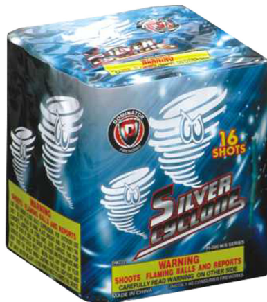
#1684 Silver Cyclone 16 Shot 24-1 Dominator