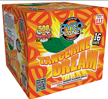
#1808 Tangerine Dream 16 Shot 4-1 Pyro Planet