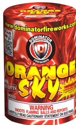
#1681 Orange Sky 10 Shot 30-1 Dominator