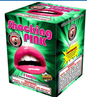
#1692 Shocking Pink 7 Shot 24-1 Dominator