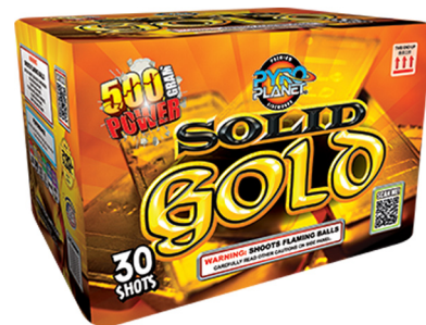
#1796 Solid Gold 30 Shot 4-1 Pyro Planet