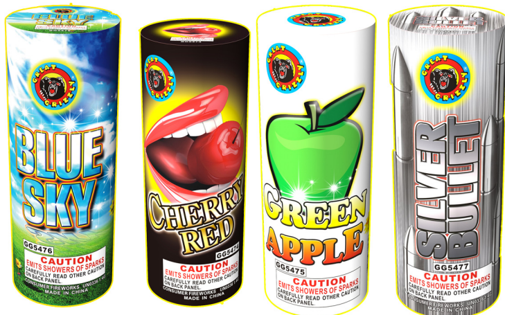
#1670 Premium Fountain Assortment 9-4 Great Grizzly