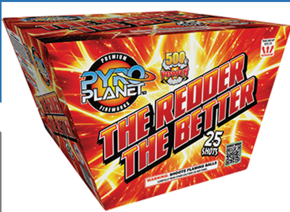
#1807 The Redder The Better 25 Shot 4-1 Pyro Planet

What's your favorite color? No matter what it is we've got you covered with our line up in every shade of the rainbow!