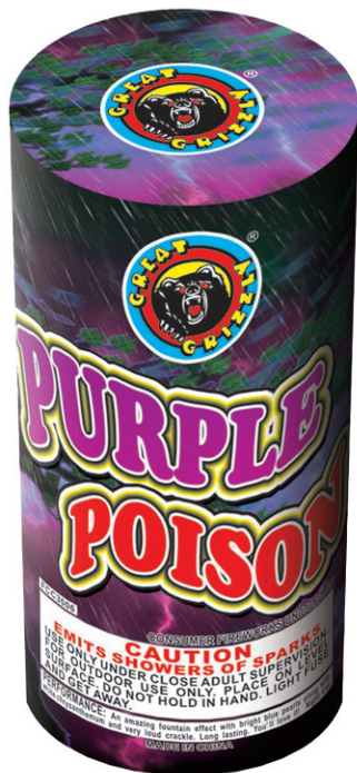
#1071 Purple Poison Ftn 36-4 Great Grizzly