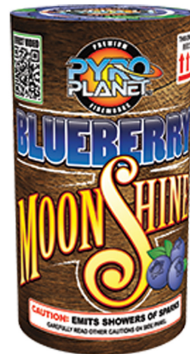
#1792 Blueberry Moonshine Ftn 18-1 Pyro Planet