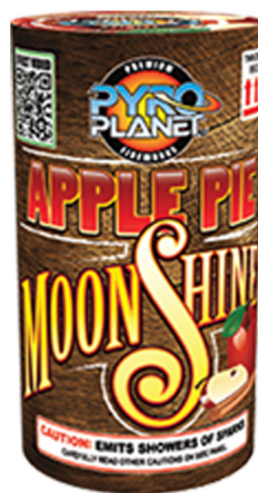
#1791 Apple Pie Moonshine Ftn 18-1 Pyro Planet