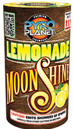
#1793 Lemonade Moonshine Ftn 18-1 Pyro Planet