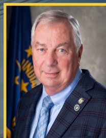
State Senator Jim Tomes Senate District 49