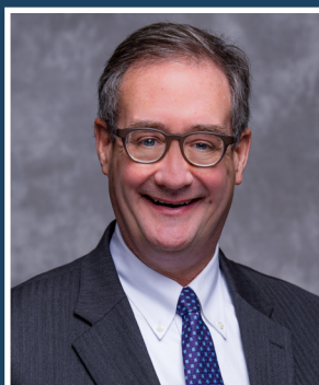
Senate District 30