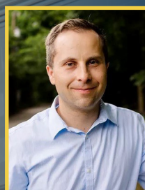
State Senator Spencer Deery Senate District 23