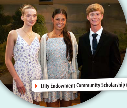
▶ Lilly Endowment Community Scholarship recipients

Learn more at jccf.org/scholarships or scan ▶