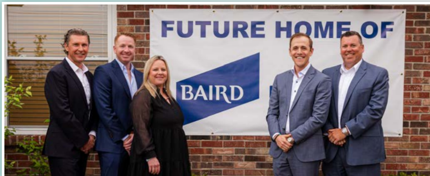
▶ The Matthews Snyder Group

MISSION: Be a Great Teammate: To our clients, colleagues and community.