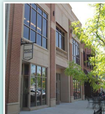
► The Daily Journal office is on East Court Street in downtown Franklin.

We fund this work through a variety of marketing solutions, including print, digital services, custom publishing, direct mail and more. We are as much a marketing company as we are a news gathering organization. We depend on the support of our advertisers and readers in all of our efforts. We also truly appreciate our partnership with the Johnson County Community Foundation going back to when we assisted in its founding. We share the Foundation's mission to make Johnson County a great place to live.