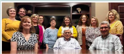
▶ The Compass Pointe CPAs team

THIS IS WHY WE GIVE BACK – to serve and encourage the community around us; who are our friends, colleagues and clients. It is truly an honor to live out our mission, of being relationally-driven, far beyond the walls of our office.