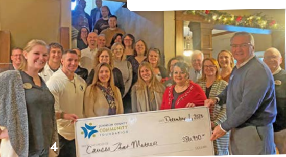
► The 2023 Small Cycle grant recipients