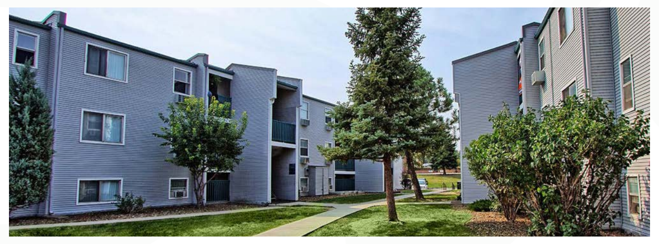
Lincoln Springs Apartments, an investment project from Life Bridge Capital

In fact, the kinds of life changes listed above are exactly why Life Bridge Capital was founded. A passive income creates new opportunities in your life and helps you build a bridge to a brighter future.