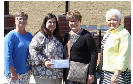
Photo: Representatives from Rainbows and Rhymes Preschool.

Early childhood education continues to be a major focus for the MCCF. In this grant cycle, we awarded $60,279 to three local child care facilities.