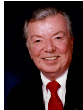
One of our newest scholarship funds is the Ted Ratcliff Scholarship Fund benefitting North Montgomery high school graduates. Currently, we have 53 scholarship funds.

Since 1994, over $8 million in scholarships have been awarded to Montgomery County graduates!