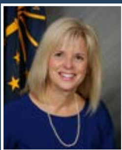
State Senator Liz Brown Senate District 15