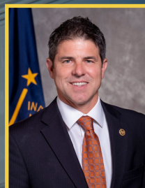
State Senator Rodric Bray Senate District 37