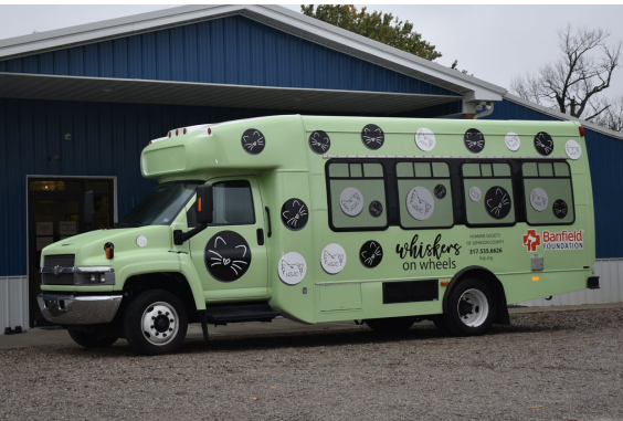
A ribbon cutting celebration on October 29, 2020 launched Johnson County Humane Society's Whiskers on Wheels mobile adoption vehicle.