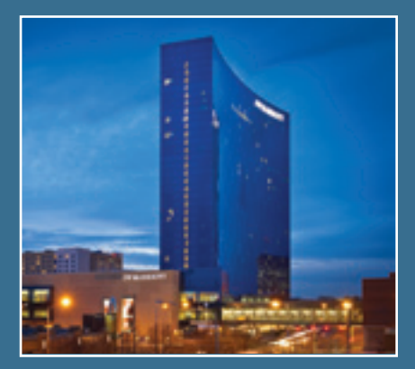
LOCATION: The JW Marriott is located in the heart of Indianapolis' thriving downtown area. Within walking distance of such attractions as the NCAA Hall of Champions, the Indiana State Museum, the Eiteljorg Museum and Lucas Oil Stadium, as well as all the unique shopping, dining and entertainment options Indy has to offer, your whole family is sure to enjoy the city this summer!

We hate lawsuits. We loathe litigation. We help doctors head off claims at the pass. We track new treatments and analyze medical advances. We are the eyes in the back of your head. We make CME easy, free, and online. We do extra homework. We protect good medicine. We are your guardian angels. We are The Doctors Company.