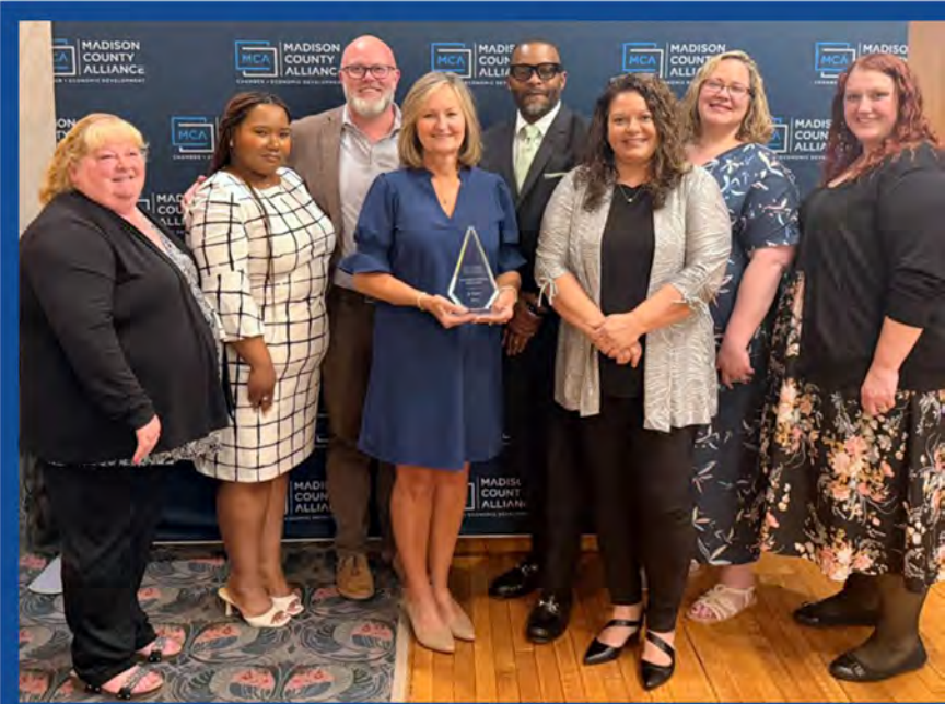
Independent Federal Credit Union was honored to receive recognition from the Madison County Alliance for celebrating 80 years of service to our great members. 1946 - 2026

As we celebrate our 80th Anniversary, we're taking time to reflect on the relationships, milestones, and memories that have shaped our story. From our roots serving Delco Remy employees to becoming a community-focused credit union serving five counties, our success has always been built on the trust and support of our members. Most importantly, we're celebrating the people who have made these 80 years possible—you.