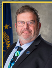
State Senator Blake Doriot Senate District 12