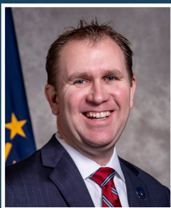
State Senator Brian Buchanan Senate District 7