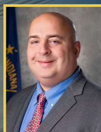
State Senator Jon Ford Senate District 38