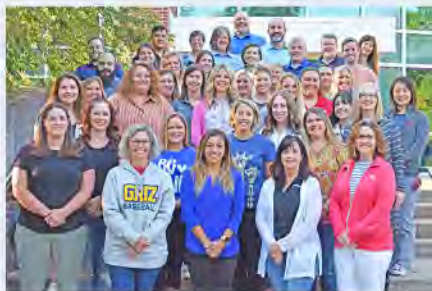
LJC Class of 2023