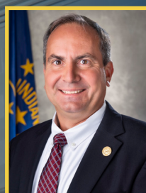
State Senator Mike Bohacek Senate District 8