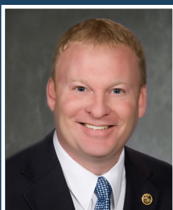
State Senator Randy Head Senate District 18