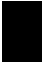
Full Page 7-1/2" w x 9-3/4" hi