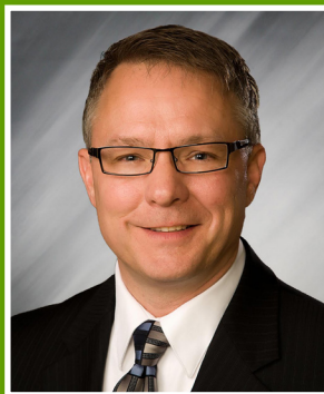
SENATE DISTRICT 27