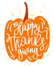
Table Decorations – Debbie Sakson