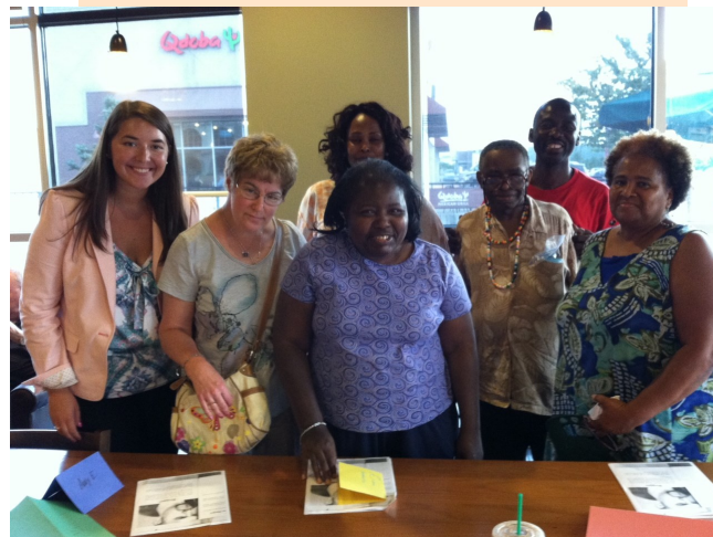
(Below: Tangram’s Next Chapter Book Club)