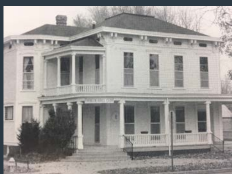
A Commercial Façade Matching Grant and Commercial Loan Project at 200 E. Madison St.