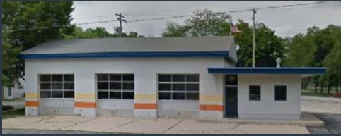
A Commercial Façade Matching Grant Project at 296 E. Jefferson St.