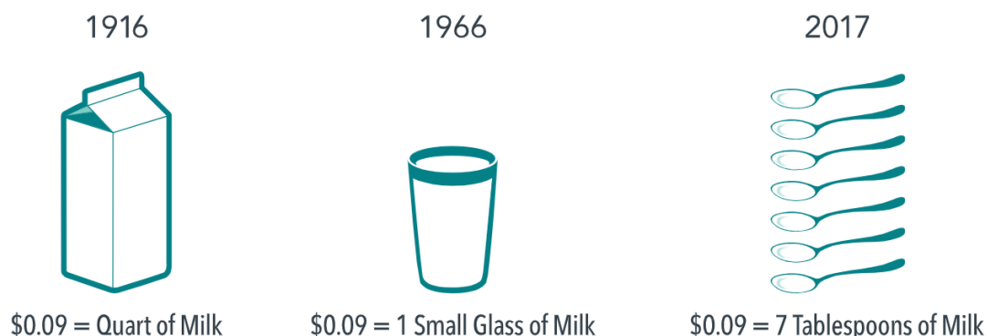
Exhibit 1 Your Money Today Will Likely Buy Less Tomorrow

In US dollars.