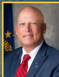
State Senator Michael Crider Senate District 28