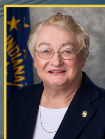
State Senator Sue Glick Senate District 13