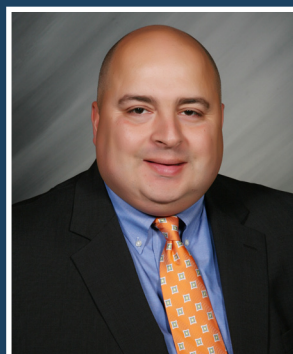
Senate District 38