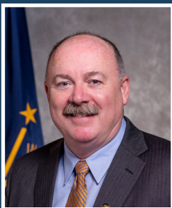
State Senator Chip Perfect Senate District 43