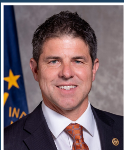
State Senator Rodric Bray Senate District 37