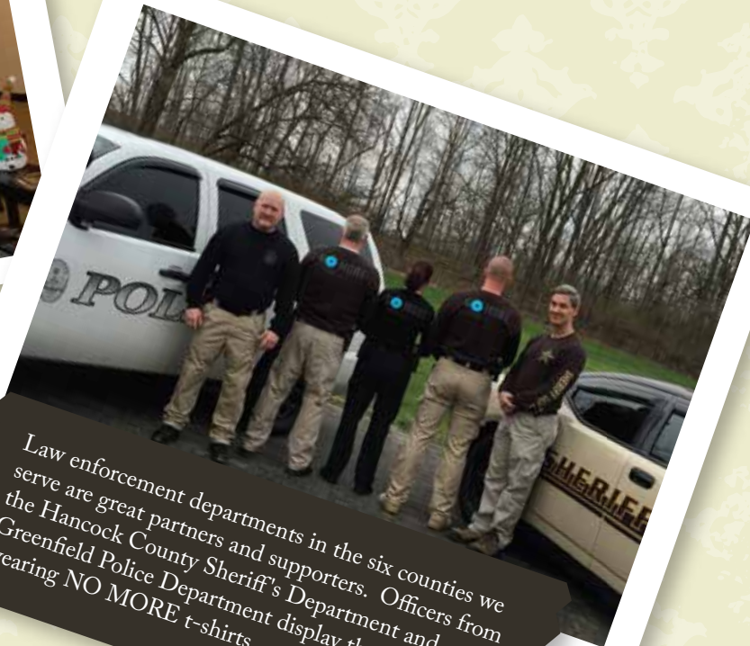
Law enforcement departments in the six counties we serve are great partners and supporters. Officers from the Hancock County Sheriff's Department and Greenfield Police Department display their support by wearing NO MORE t-shirts.