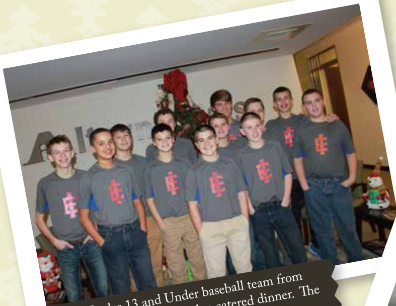
The Indiana Eagles 13 and Under baseball team from Fishers provided our families with a catered dinner. The boys served as waiters and dishwashers!