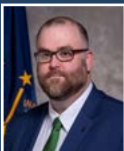
State Senator Justin Busch Senate District 16