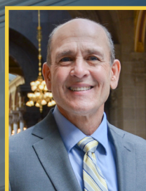
State Senator Gary Byrne Senate District 47