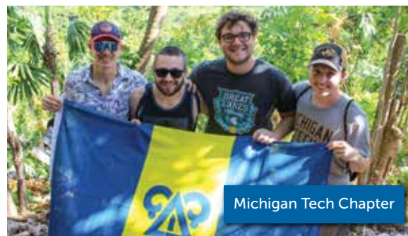
Michigan Tech Chapter

The inaugural award was presented to six chapters: Alberta Chapter, Bradley Chapter, Clarkson Chapter, Kansas State Chapter, Michigan Tech Chapter, and Western Reserve Chapter. In addition to hosting virtual chapter meetings, these groups had great success with online game nights, brotherhood check-ins, philanthropy, alumni events and more.