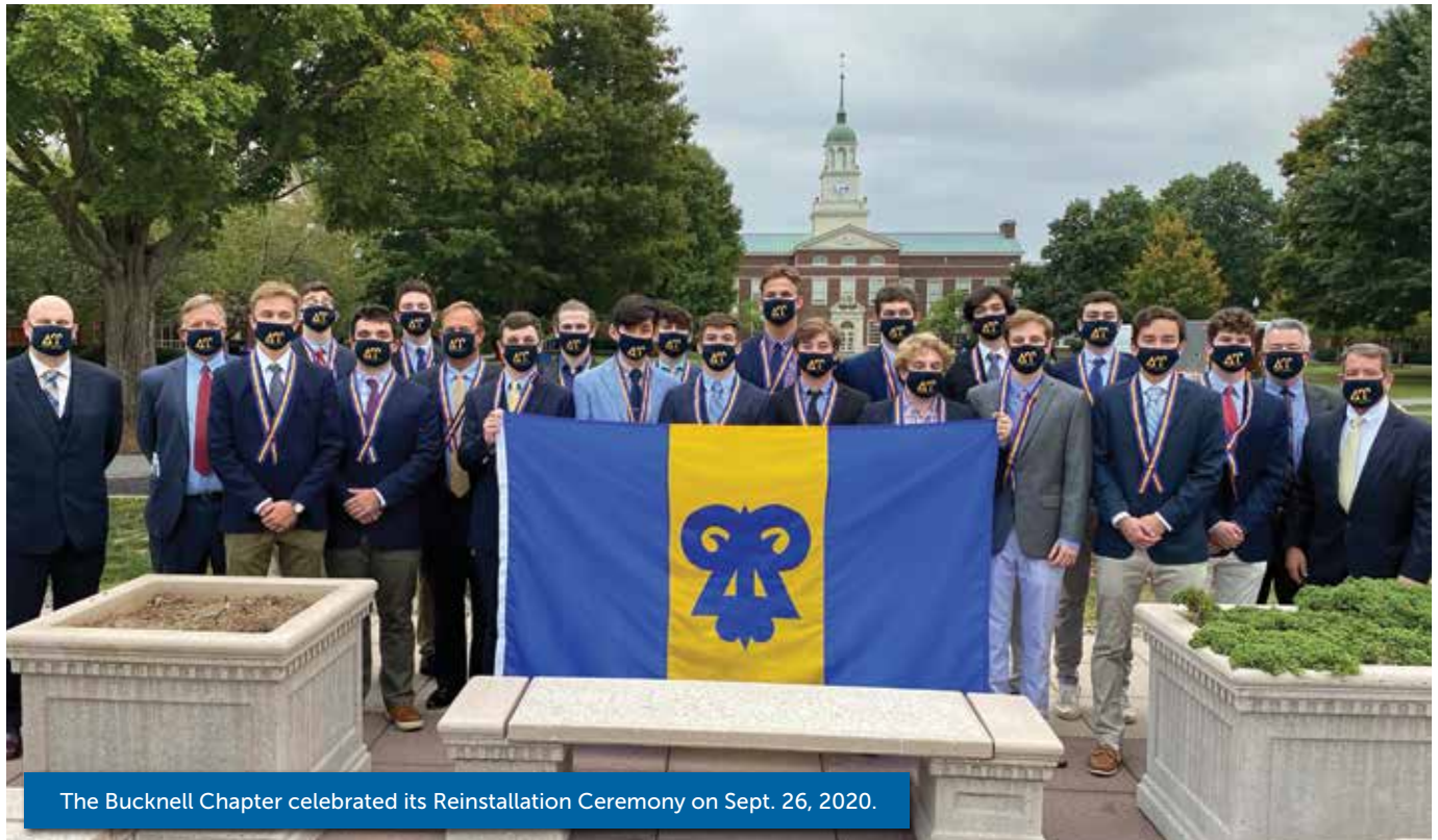
The Bucknell Chapter celebrated its Reinstallation Ceremony on Sept. 26, 2020.