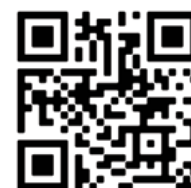
Member Referral Form

Membership referrals are a great way to support a DU chapter. If you know incoming or current unaffiliated students on a campus with a DU chapter, complete our Member Referral Form. DU staff will connect referrals to the appropriate chapter and may reach out to the student.