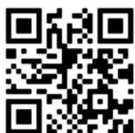
Volunteer Interest Form

Successful Delta Upsilon chapters have one thing in common: strong alumni and chapter advisor support. If you are interested in serving as an advisor for any DU chapter/associate chapter, complete our Volunteer Interest Form, and a member of the IHQ staff will be in touch.