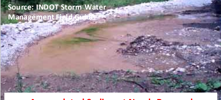
Accumulated Sediment Needs R

Repair eroded or damaged areas. When accumulated sediment reaches ¼ the height of the berm, remove the sediment. If ponding excessive, consider alternative BMPs.