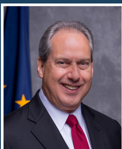
State Senator Phil Boots Senate District 23