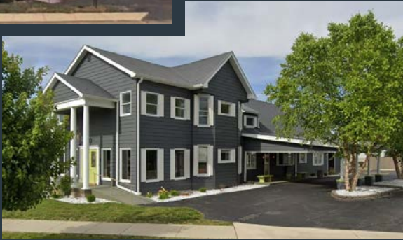
A Residential Revolving Loan Fund Project at 400 W Jefferson St