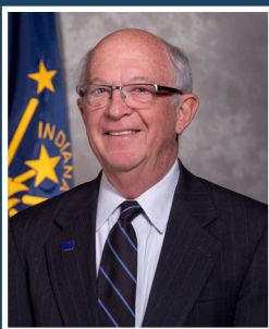
State Senator Ron Grooms Senate District 46