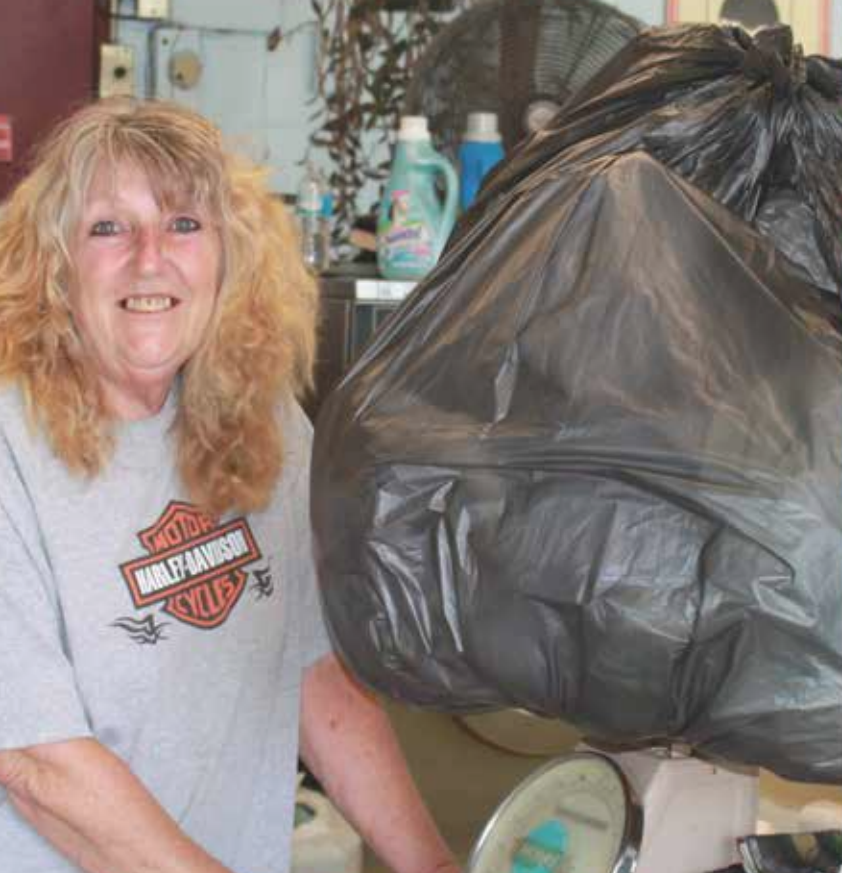
A&J Laundry washed and dried shelter linens.