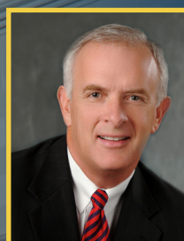
State Senator Travis Holdman Senate District 19