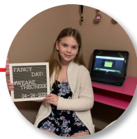
Remote Learning Model Combination remote/ e-Learning instruction