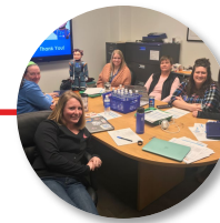
School Day Operations Daily student/staff procedures