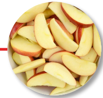
Food Services Model Procedures for students breakfast/lunch