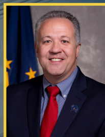
State Senator Mike Gaskill Senate District 26