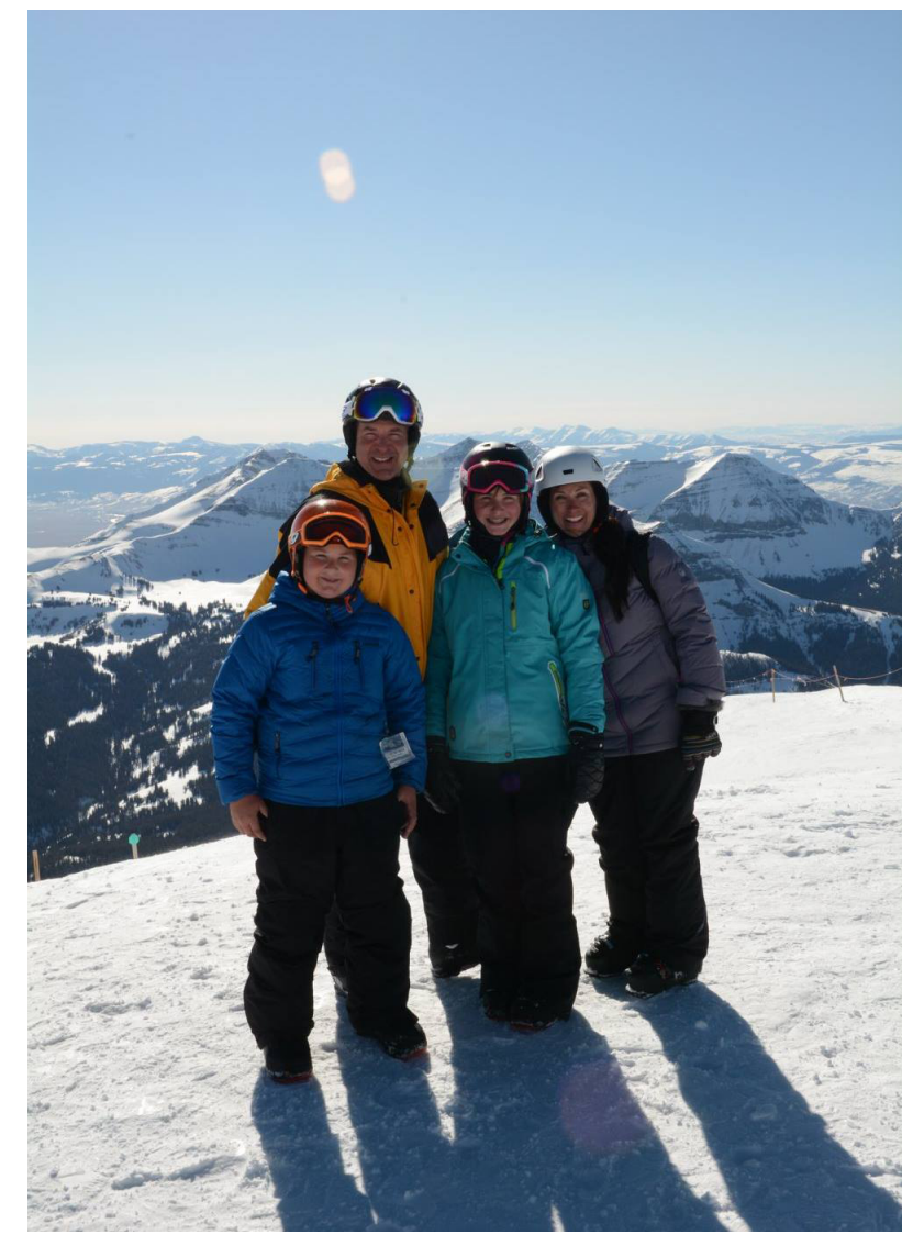
SKI TRIP - BIG SKY MONTANA

Silence and energy management are the keys to great success when traveling with children. Prepare wisely, handle the logistics and you will be awe-mazed!