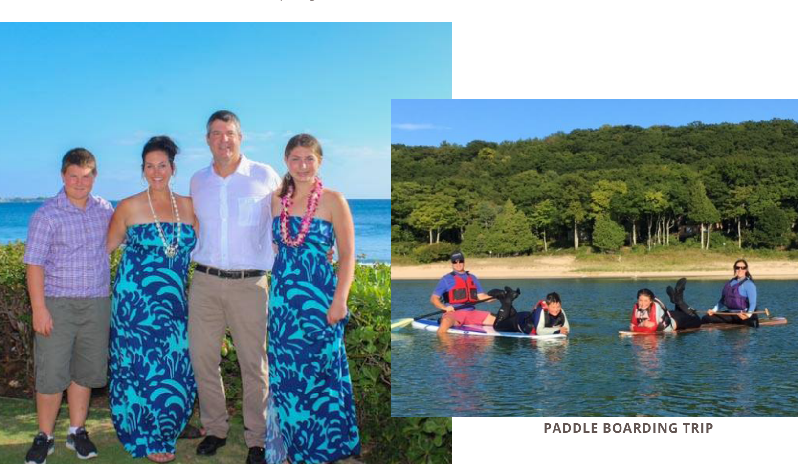
HAWAII ADVENTURE - THE KIDS 13, AND 11

There is an issue. You feel stuck with the paradigm with the kids in school, school schedules and programs. Freedom Education is the solution.