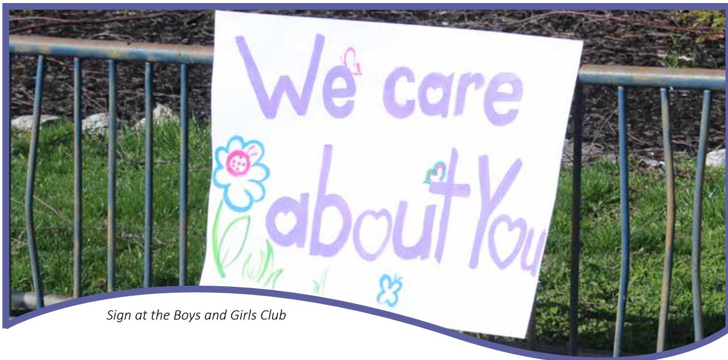
Sign at the Boys and Girls Club