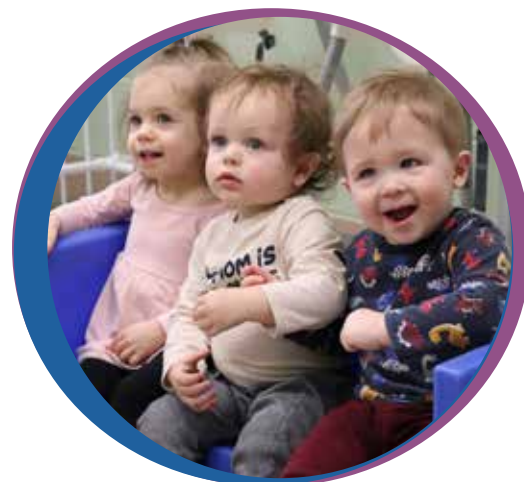
Children from Hand In Hand Creative Learning

We are so grateful to Early Learning Indiana for providing an oasis in our child care desert through this grant award, and for their investment in our children. The work continues in our efforts to increase recognized high quality child care programs in our community, but this is a great beginning of good things to come.