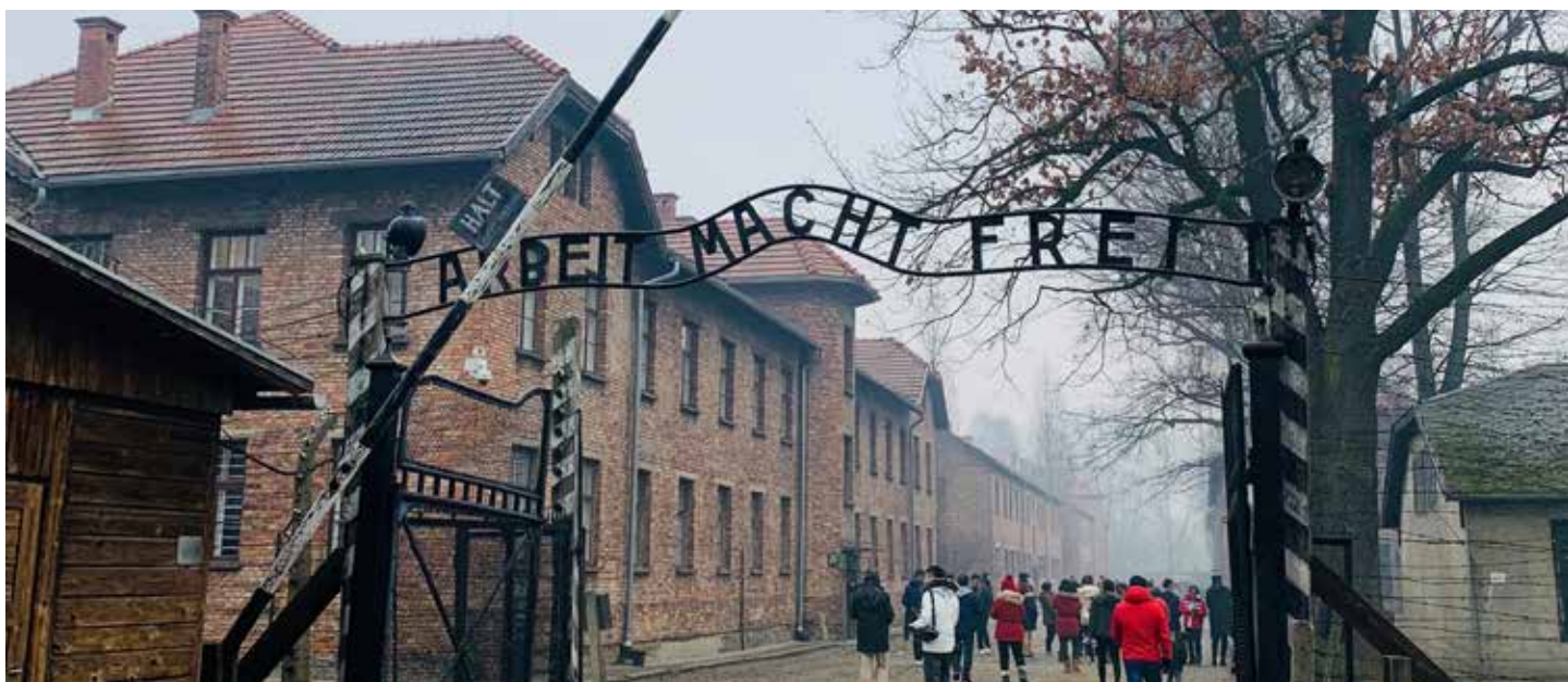
Sign over Auschwitz states "Work will free you" - a sign of mockery as the gate never led to freedom, only pain and death.