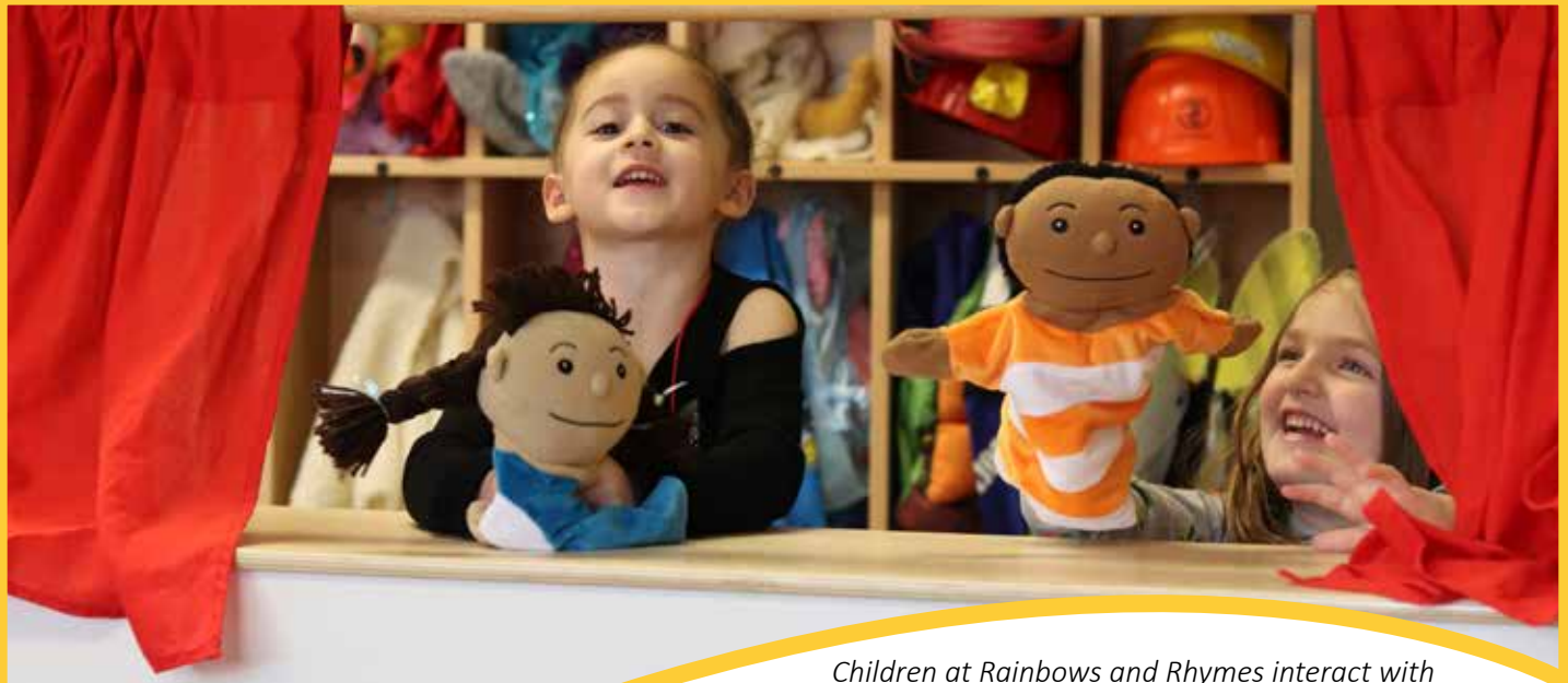
Children at Rainbows and Rhymes interact with puppets used in the Second Step curriculum