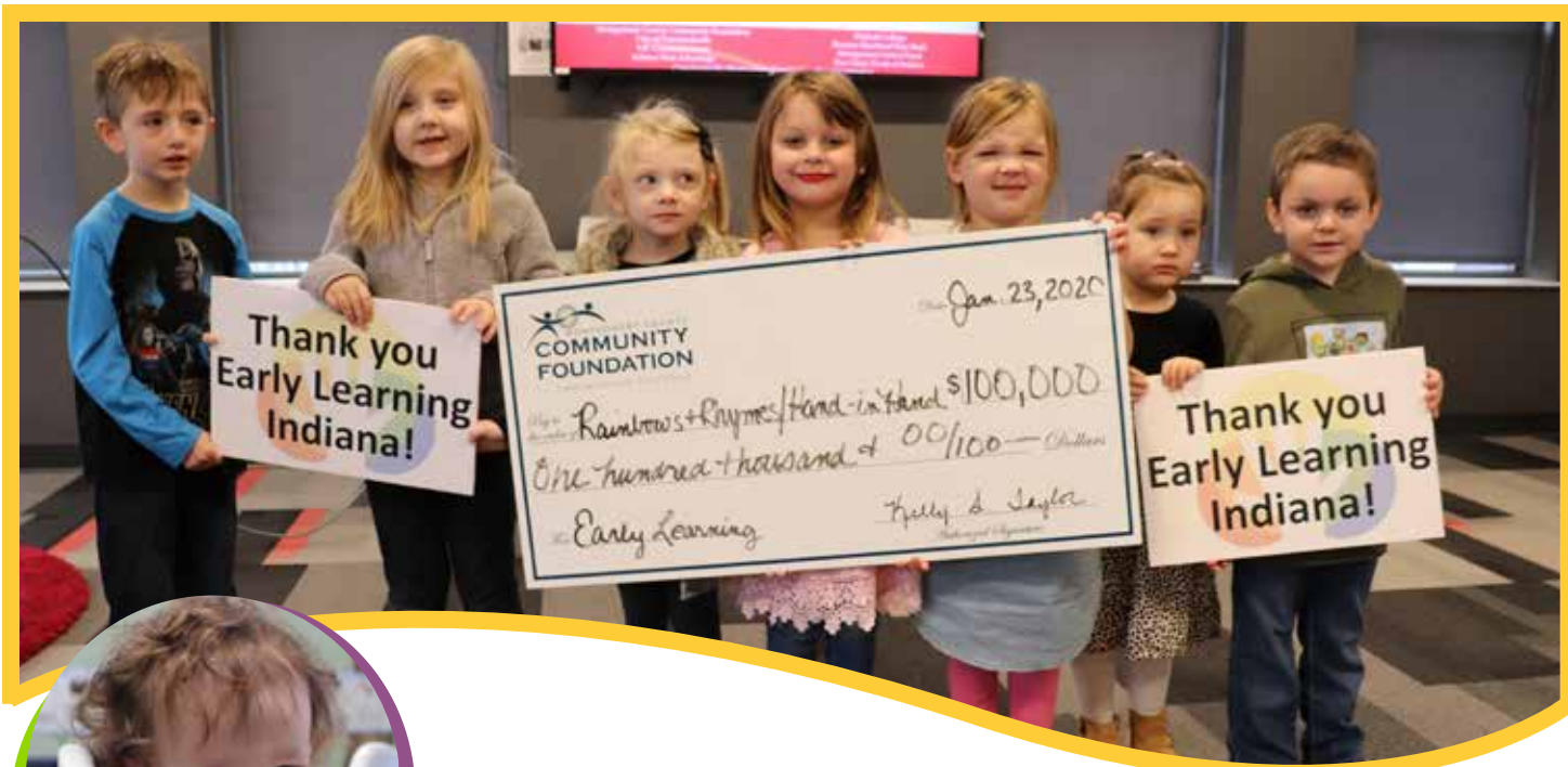
Children from Rainbows and Rhymes