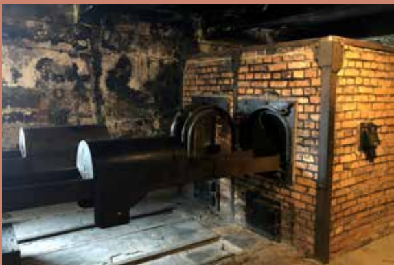
Crematorium could reduce 340 corpses per day to ashes