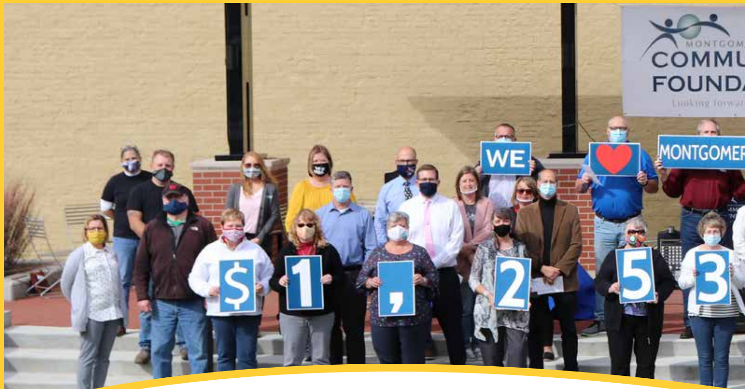
2020 MCCF Unrestricted Grant recipients at our Grant Awards presentation. We worked with MCFU to provide COVID-19 emergency grants and celebrated the awards together.

Milligan's Flowers: Support from designated fund for cemetery flowers