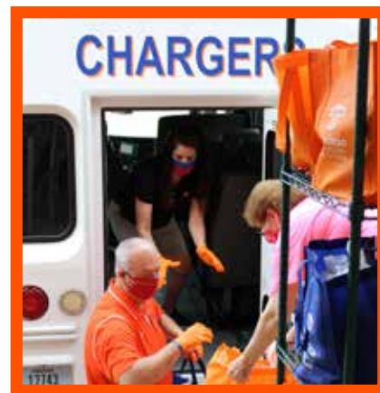
(l-r) South Montgomery, Crawfordsville, and North Montgomery staff and volunteers prepared and delivered hundreds of lunches for students thanks to MCCF COVID-19 Emergency grants.