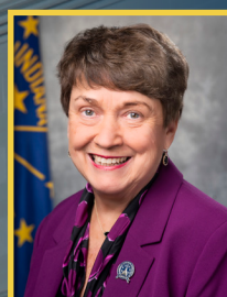
State Senator Jean Leising Senate District 42