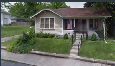
A Residential Revolving Loan Fund Project at 39 Uitz St