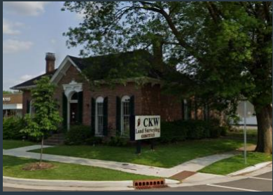
A Commercial Façade Matching Grant Project at 301 E Jefferson St