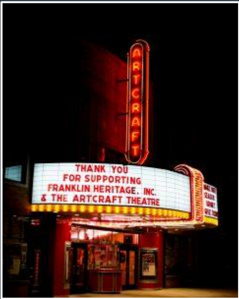
The Historic Artcraft Theatre was just one of thirty-six businesses to receive funding from the Small Business Grant.

Extraordinary times call for extraordinary measures. The pandemic has affected every facet of life in Franklin. Local businesses are very important Franklin and the city's identity. In light of this, the Franklin Development Corporation worked with the City of Franklin to create a Small Business Grant where businesses within the community with 15 or fewer employees among other criteria could apply for a maximum grant amount of $7,500. The City received $200,000 in funding from the Indiana Office of Rural and Community Affairs' (OCRA) and the Franklin Development Corporation added $50,000 to the fund. Thirty-six businesses received at least partial funding.