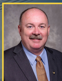
State Senator Chip Perfect Senate District 43