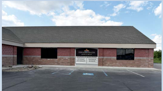
PHOTOS OF WEST 7TH STREET LOCATION CONSTRUCTION SHOWN ABOVE AND GROUND BREAKING BELOW